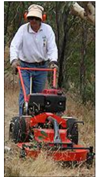
Using the mower to clear walking track of unwanted grass in Para Wirra Recreation Park.