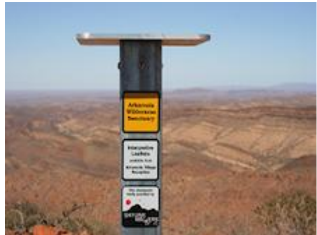
Post and plate, Acacia Ridge

We are pressing ahead with the production of walk notes downloadable from the web or as hard copy leaflets. We are unclear quite where we stand with DEH on the hard copies, but we do have some funds from the donation boxes which we feel could be applied to interim leaflets for trailheads.