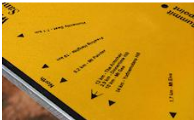
Section of 'topograph' plate

Contacts: Please direct all correspondence to the Secretary.