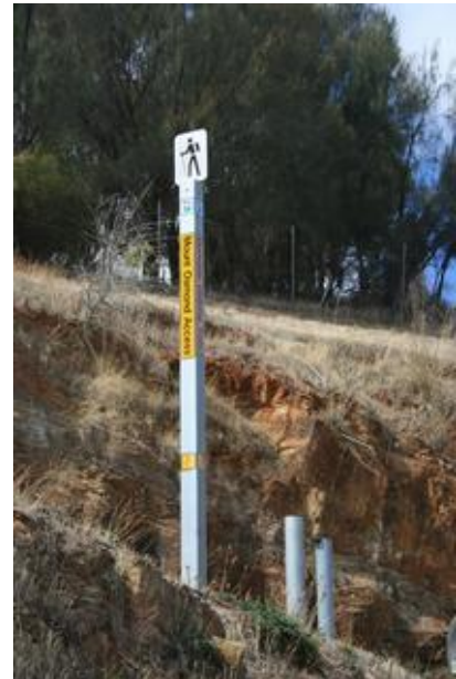
An obvious and visible trailhead is a great help when you are looking for where to start a walk